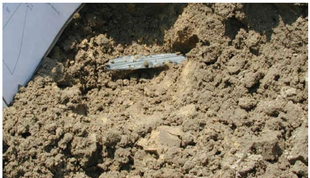
Figure 1. Soil type such as clay loam (upper) and sandy loam (lower) along with crop type will determine dripline spacing and depth.